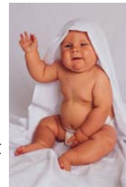
Child of God!

On the date of the baptism, it is customary for the child to wear white, but it is not mandatory. The parish will provide a baptismal candle for the child but gift sets may also be purchased for this special occasion at local retailers or the church gift store.