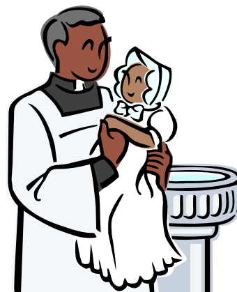
A joyous occasion!